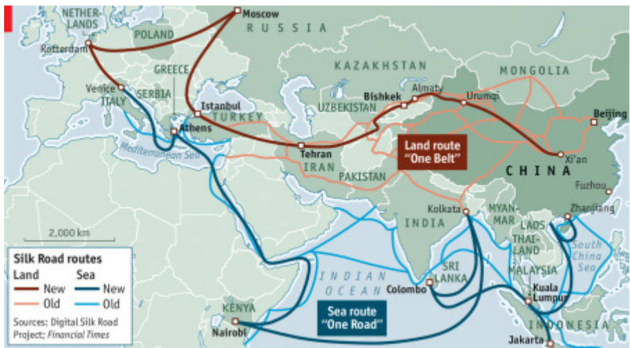
Figure 4. Overland and Maritime “One Belt, One Road” Connections